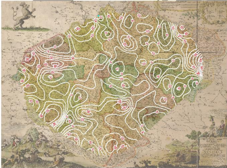
Figure 5: Rotation isolines of Vogt's map generated with the step 10^{\circ} .