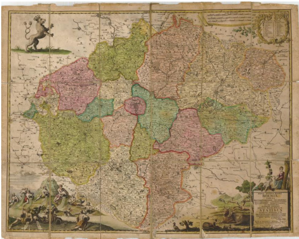
Figure 1: Illustration of Vogt's map from the Map Collection of the Faculty of Science, Charles University in Prague.

The original of Vogt's map was scanned using the large-format scanner Contex CRYSTAL XL 42 with the resolution 200 dpi in the format TIFF. Pixel size was 0.127 mm. Then retouching of raster was performed removing impurities with software. This step was performed with the help of the tool Remove Speckles in the program MicroStation Descartes XM.