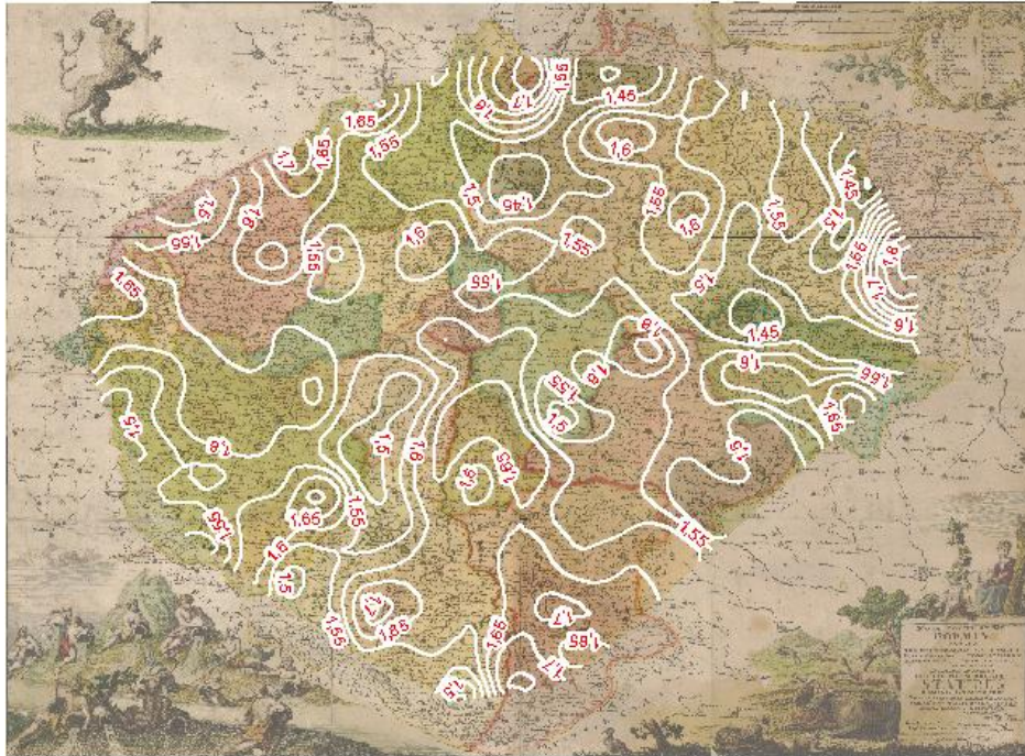
Figure 4: Scale isolines of the longitudes of Vogt's map generated with the step 0.05.

about the coordinate z necessary for the creation of a 3D model. The function TopoToRaster was used to generate a 5m raster model from these data. This process led to the creation of two 3D models showing the dependence of the scale and rotation on the geographical position of the point. Using the extension 3D Analyst isolines of scale and rotation were generated for these two models. Their descriptions were created in the extension Maplex.