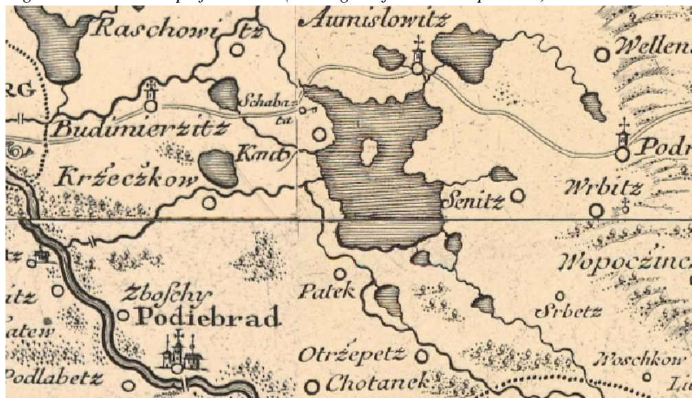
Figure 3. Müller's map of Bohemia (detail of georeferenced map sheets)

Maps of 2nd Military Mapping Survey of Austria-Hungary are based on the cadastral mapping and have defined cartographic projection and size of map sheets. It is possible to compute coordinates of corner points in Gusterberg coordinate system (for Bohemia) or St. Stephen coordinate system (for Moravia). Cartographic projection is Cassini-Soldner (transverse cylindrical projection equidistant in cartographic meridians with fundamental points Gusterberg for Bohemia and St. Stephen for Moravia). Thus all corner points of map sheets were computed. After that every map sheet was georeferenced separately using projective transformation with 4 corner points. Precision of these maps was tested by independent control points. RMSE for maps of 2nd Military Mapping Survey of Austria-Hungary was only about 20 m in reality.