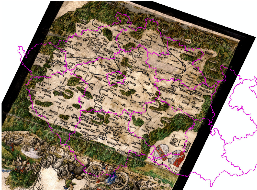
Figure 1. Klaudyan's map of Bohemia (1518) georeferenced and superimposed with Czech republic borders

Criginger's map (1568) is the second known map of Czech lands. Its size is approximately 51 by 34 cm. The map was vectorized as well; 319 point features were used as GCPs. After removing 5 points (errors by author) the map was georeferenced using affine transformation into "Lat/Long" projection with RMSE 14.0 km in reality. Other parameters such as mean scale or rotation of the map were computed as well.