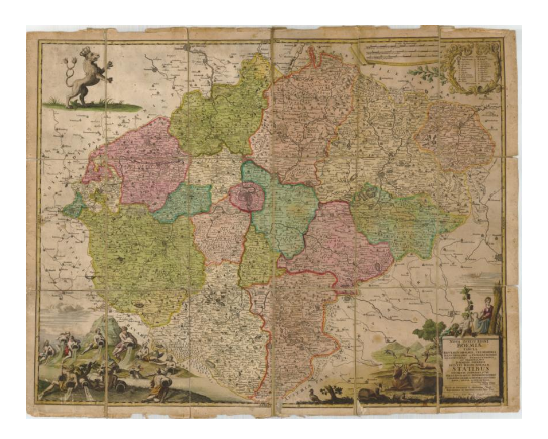
Figure 1: Illustration of Vogt's map from the Map Collection of the Faculty of Science, Charles University in Prague.

The original of Vogt's map was scanned using the large-format scanner Contex CRYSTAL XL 42 with the resolution 200 dpi in the format TIFF. Pixel size was 0.127 mm. Then retouching of raster was performed removing impurities with software. This step was performed with the help of the tool Remove Speckles in the program MicroStation Descartes XM.