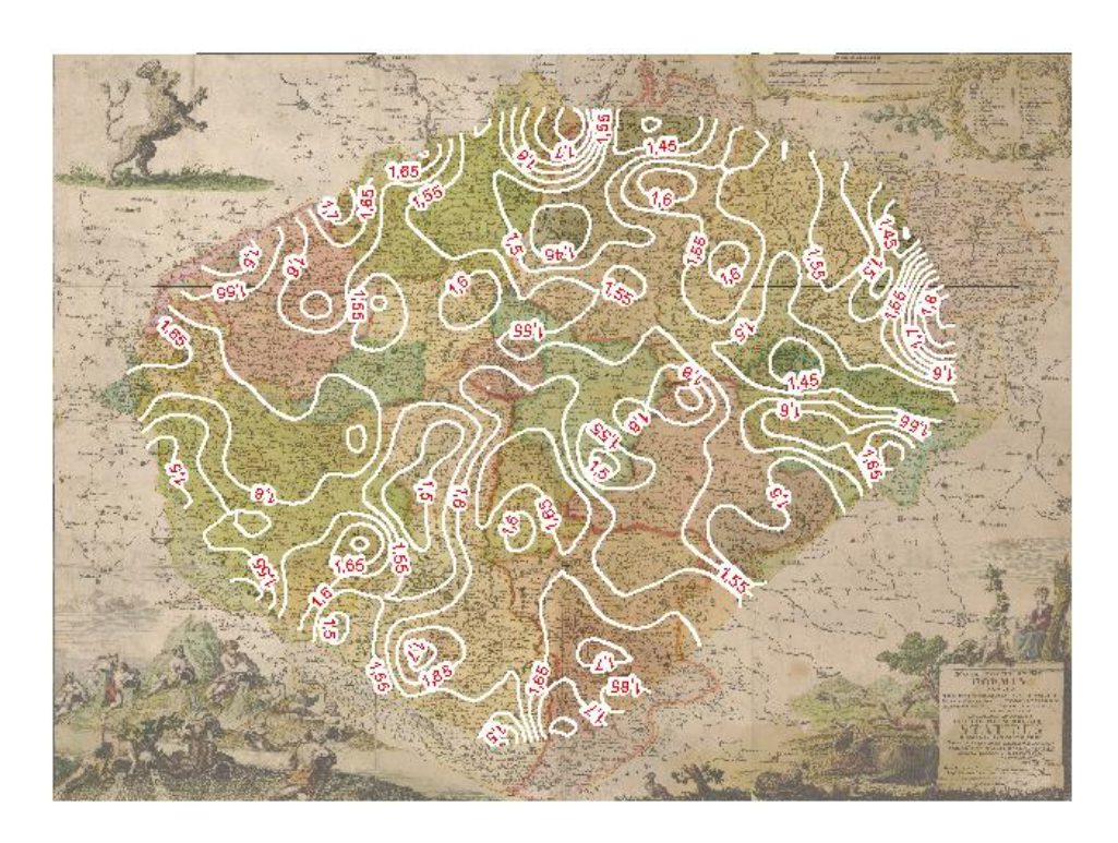
Figure 4: Scale isolines of the longitudes of Vogt's map generated with the step 0.05.

about the coordinate z necessary for the creation of a 3D model. The function TopoToRaster was used to generate a 5m raster model from these data. This process lead to the creation of two 3D models showing the dependence of the scale and rotation on the geographical position of the point. Using the extension 3D Analyst isolines of scale and rotation were generated for these two models. Their descriptions were created in the extension Maplex.