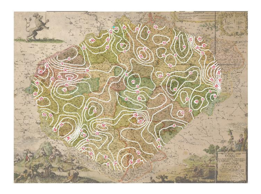
Figure 5: Rotation isolines of Vogt's map generated with the step 10^{\circ} .